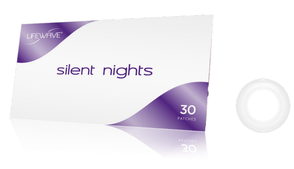
Silent Nights® Enhances the quality and increases length of sleep