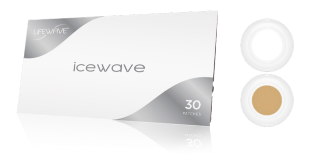
IceWave Fast-acting, safe and natural pain relief for whole body and local pain