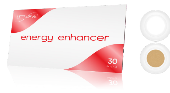
Energy Enhancer Clinically proven to increase energy and endurance

Clinically shown to mobilize and activate stem cells