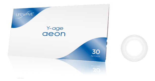
Y-Age Aeon Clinically proven to reduce stress and decrease inflammation